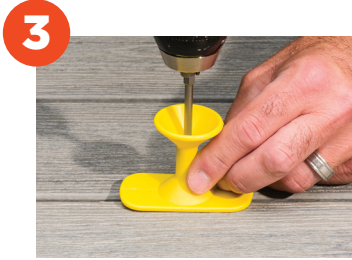
3 Fasten with the included Never-Miss™ Guide.