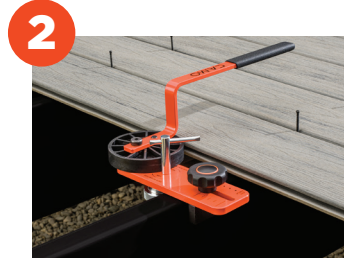
2 Lock them in place with 2-4 LEVER™ board bending and locking tools.