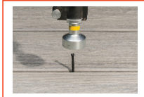
OPTIONAL: Fasten with the DRIVE™ stand-up tool.