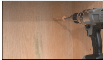
INTERIOR GENERAL CONSTRUCTION PROJECTS