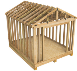
EXTERIOR GENERAL CONSTRUCTION PROJECTS