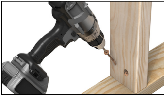
WOOD-TO-WOOD FRAMING CONNECTIONS