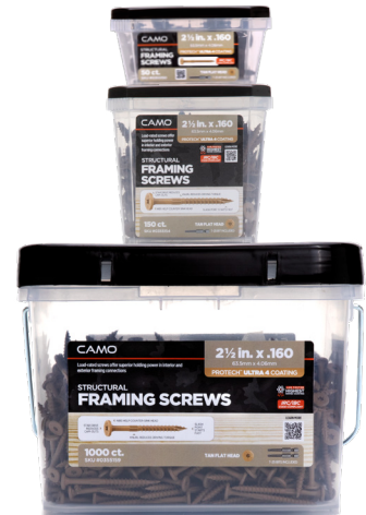
AVAILABLE IN 50CT, 150CT, AND 1,000CT.

Our industry-leading coating protects your connections against the harshest environmental elements. And we've got your back - our products are guaranteed by a Lifetime Limited Warranty. Trust CAMO® when your connections count. Read the full warranty at camofasteners.com